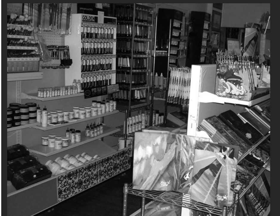
Newburgh Art Supply, on Liberty Street in the city's historic district, carries an array of paints, brushes, paper and other supplies.