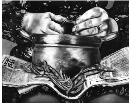
Hands, Womens Work

www.ShawnDellJoyce.com or www.WallkillRiverSchool.com